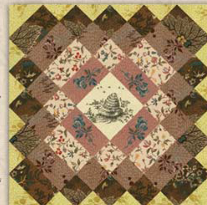
Reproduction of the actual block used in quilt seen on back cover.

Assemble in diagonal rows according to the line drawing.