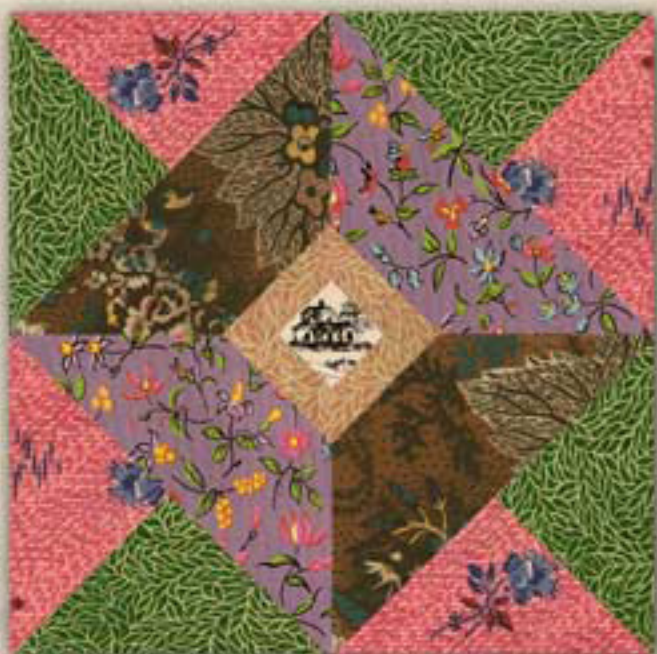
Reproduction of the actual block used in quilt seen on back cover.