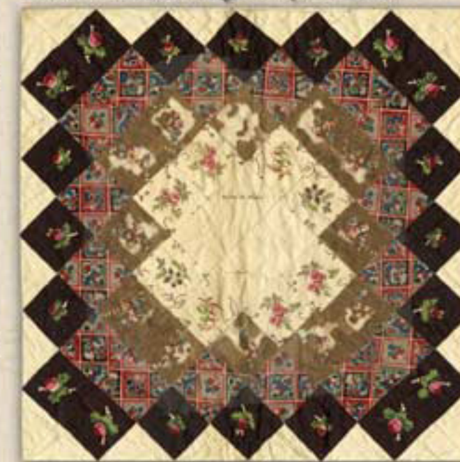
Photo of Actual Original Quilt Block