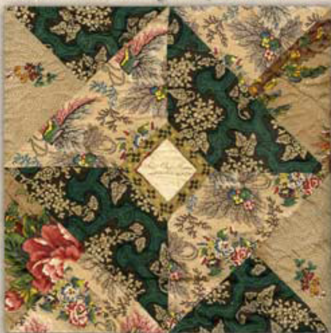
Photo of Actual Original Quilt Block