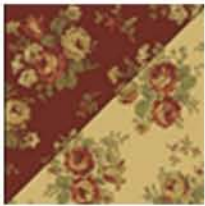
A - Make 12