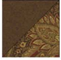
F - Make 4

Block A: Make 12 using preceding instructions for making Half Square Triangles. After sewing each unit, then trim each one to exactly 6\frac{1}{2} " using a 6\frac{1}{2} " square ruler. All following blocks are sewn in this manner.