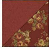
E - Make 8