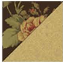
C - Make 16