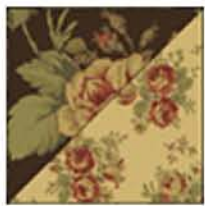
B - Make 12