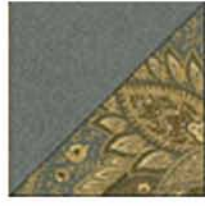
D - Make 12